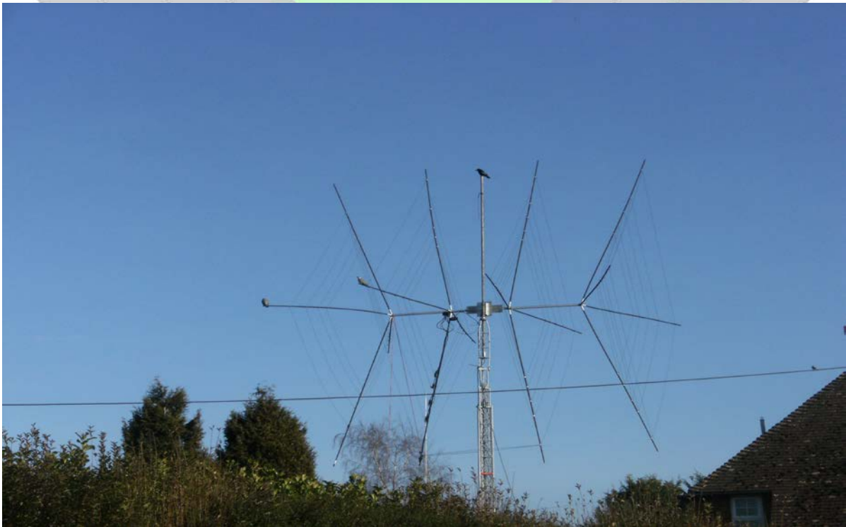
A very nice looking Quad spotted outside!!